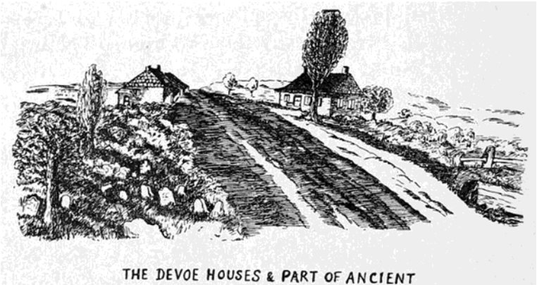
GRAVE-YARD ON THE WOODPOINT ROAD