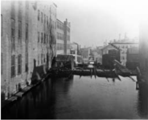
Inclined Plane 12 East, in Newark, New Jersey at High st. This is the third double-tracked plane. This spot would be Raymond Ave around University Heights, looking east towards Martin Luther King Jr. St.